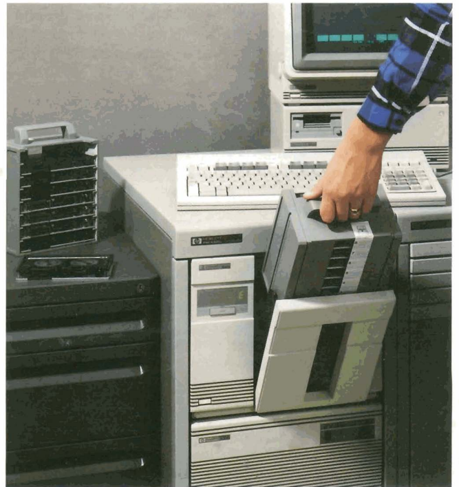
The HP 35401A 1/4-inch Cartridge Autochanger Tape Subsystem improves productivity through increased daytime system availability.

Whether used as a stand-alone unit or integrated with a computer system into HP's Design Plus cabinet, the HP 35401A fits well into the office. Its noise and heat output levels are unobtrusive, and it occupies only about one-tenth the space of a reel-to-reel tape drive. Only a few minutes are needed to learn how to use the HP 35401A and it is customer installable.