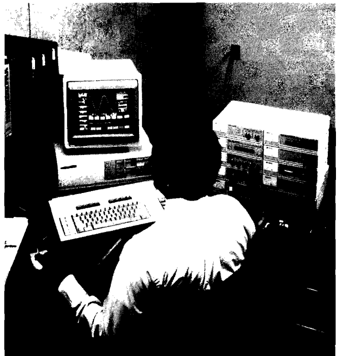
ASYST combines analytical functions with instrument control using the HP Vectra PC or the IBM PC/XT/AT.

ASYST's interactive mode also brings powerful graphics and analysis commands to your fingertips. In addition, PC Instruments' soft front panels are callable from ASYST. This provides "manual" instrument control and a helpful debugging aid when writing programs.