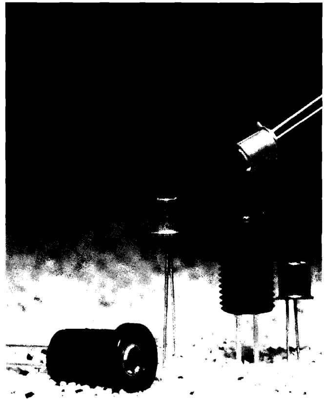
These new ultra-bright lamp families are readable in direct sunlight.

For more information, check L on the HP Reply Card.