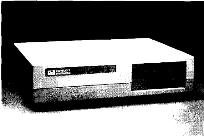
The HP 9114B features faster access to information, longer battery life, and a battery charge indicator.

The HP 9114B's new "power miser" slimline drive substantially increases battery life. With continuous use (100% duty), you can expect a battery life of 1.8 hours with the recharger