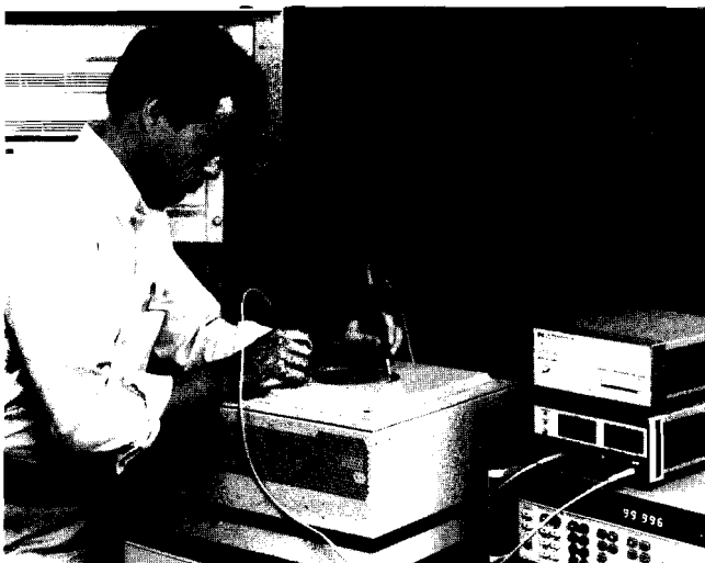
When calibrated with the HP J06-59992A Time Interval Calibrator (top right), the HP 5370B Time Interval Counter can characterize the timing accuracy of an IC tester at the test head to better than 100 ps accuracy.

A new time-interval calibrator from Hewlett-Packard Company, the HP J06-59992A, when used with the HP 5370B Universal Time Interval Counter, offers measurements accu-