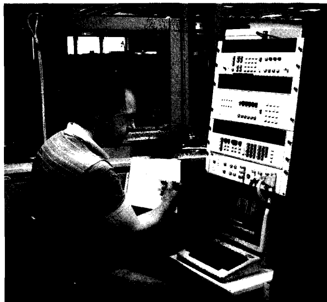
The fast, easy-to-use HP 11805 Transceiver Test Software Package can be used with the HP 8953 Transceiver Test System.

The HP 11805A Transceiver Test Software Package consists of a softkey-driven user interface program and a series of test packages written in BASIC language for the HP 9000 Series 200 and 300 Computers. The hardware for making the measurements can either be the HP 8953A Transceiver Test Set, the HP 8957S Cellular Test Set, or the HP 8955A RF Test System. The basic instruments are the HP 8903B Audio Analyzer, the HP 8656B Signal Generator, the HP 8901B Modulation Analyzer, and an interface.