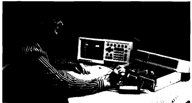
The new HP 54201A/D can assist a project team from product concept through manufacturing evaluation.

The HP 54201A/D's 50-MHz single-shot bandwidth is useful to designers of digital and analog systems who must deal with transient fault conditions. Transients as narrow as 10 ns can be captured easily, stored in waveform memory, and analyzed using a variety of built-in automatic measurement functions and time and voltage cursors.